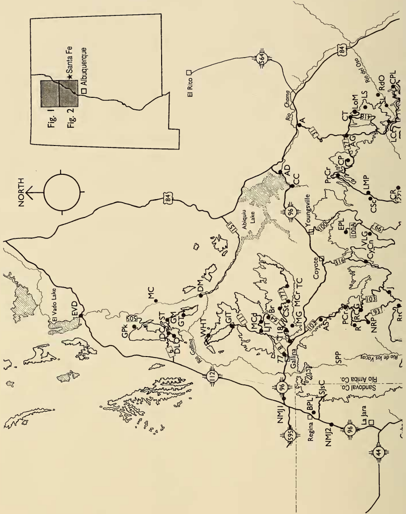
FIG. 1. Jemez Mountains, New Mexico, collecting sites (northern portion) and 8000' elevation contour. Same scale as Fig. 2.